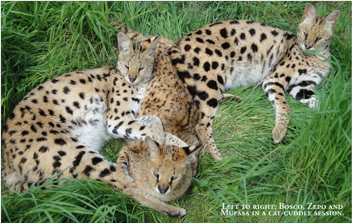
LEFT TO RIGHT: BOSCO, ZEPHO AND MUFASA IN A CAT-CUDDLE SESSION.