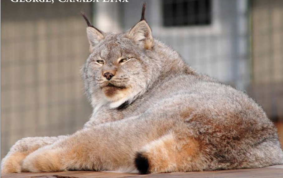
GEORGE, CANADA LYNX