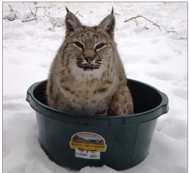
BUDDY THE BOBCAT CAN'T WAIT FOR SUMMER!

If you have ever wondered if those online Facebook promotions pay off, you proved they can! A total of 1,714 supporters voted for The Wildcat Sanctuary on Facebook in the Chase Community Giving Program . We finished in 33rd place and won a $25,000 grant. This grant will go a long way towards the sustainability of TWS.