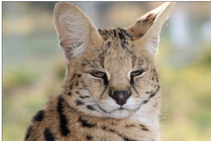
CLEO, AFRICAN SERVAL

The Wildcat Sanctuary celebrates our 3rd annual beer, cider & wine tasting safari Whiskers & Waves in Duluth, MN Tickets $30 advance / $40 at the door available on-line at WildcatSanctuary.org or by calling 320-245-6871.