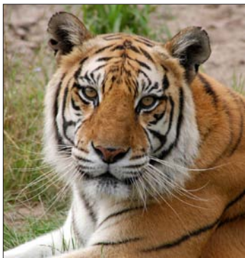
LAYLA, BENGAL TIGER IS 20 YEARS OLD

Caring for geriatric animals takes patience, commitment and knowledge. We have to be especially observant with older cats because any small change in their behavior or eating habits could be a sign of illness. Animals in the wild are programmed to hide illness and injury, which would attract predators. Here, it takes the keen observation of our keepers and the knowledge of our veterinarians to accurately diagnose illnesses. Prevention is the best measure