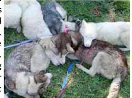
DOGS AFTER FIRST BATH

They were living with a pack mentality and continually inbreeding. We arrived and began separating the dogs, giving them flea baths. They were malnourished, some with severe health problems from being mutilated by dogs higher in the pecking order. None of these dogs had ever stepped foot outside prior to the day they were rescued. One dog went into shock and passed away from being moved from his surroundings.