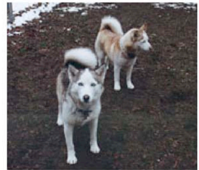
THE EARLY YEARS

the first time feel of grass or snow under their feet, fresh water to drink, nutritional food on a daily basis, enrichment from a ball to chase or a bone to chew on, and simply a warm and safe place to curl up and sleep, allowed to be each other's constant companion.