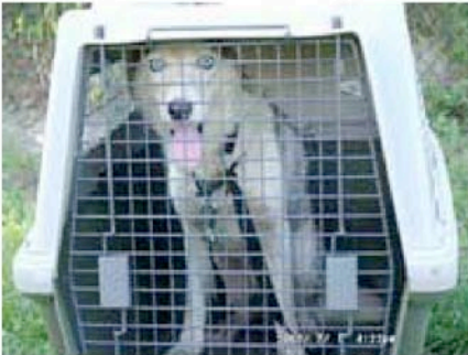
SIERRA DAY OF RESCUE

We drove all of the dogs back to MN for another bath, vet care and with a public plea for foster care. Adopt A Husky did a wonderful job ensuring these neglected animals received the best of care, especially since they were so difficult to place because of their lack of socialization.