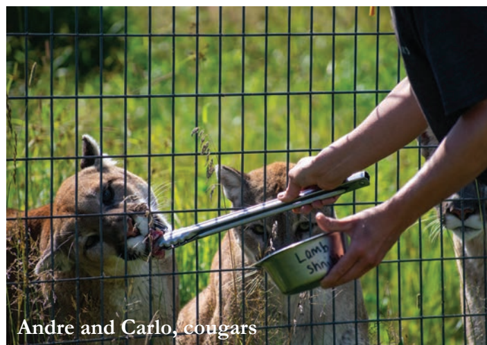
Andre and Carlo, cougars

For instance, 26-year-old lion Shanti Deva has caretakers assigned to take daily walks with her around the fence line. This helps her joints and, when she's up, it also stimulates her to drink from her water bowls. That supports better kidney function.