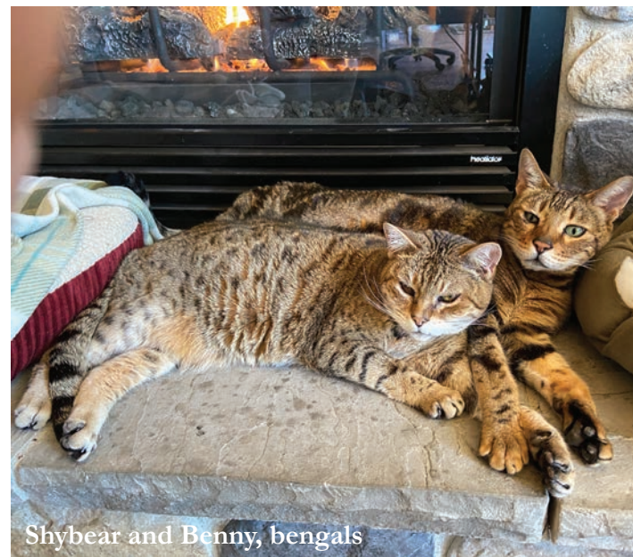
Shybear and Benny, bengals