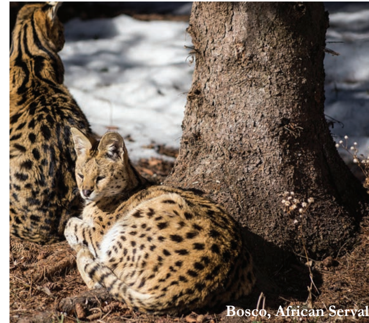
Bosco, African Serval