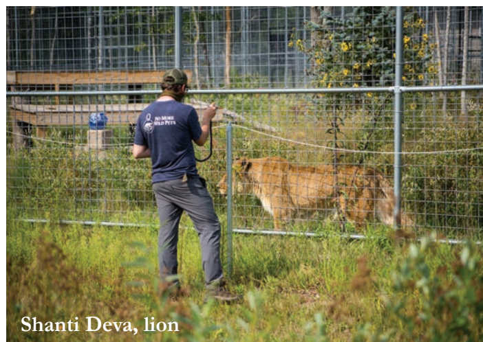
Shanti Deva, lion