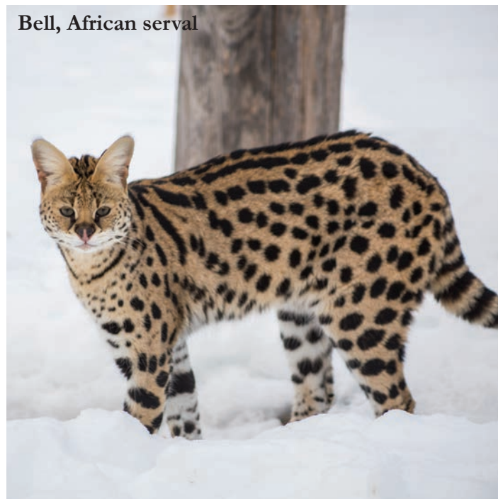
Bell, African serval