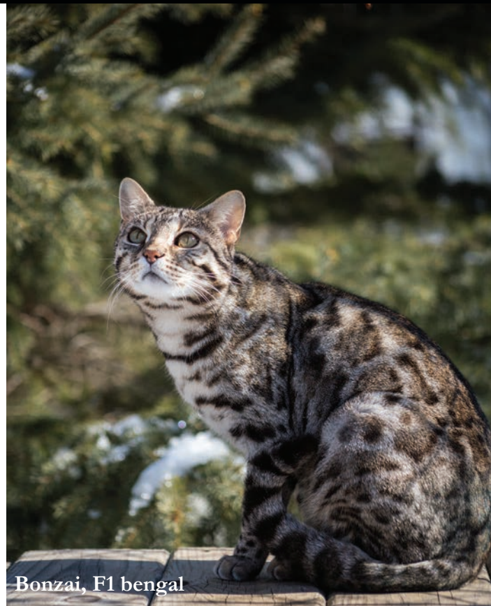
Bonzai, F1 bengal