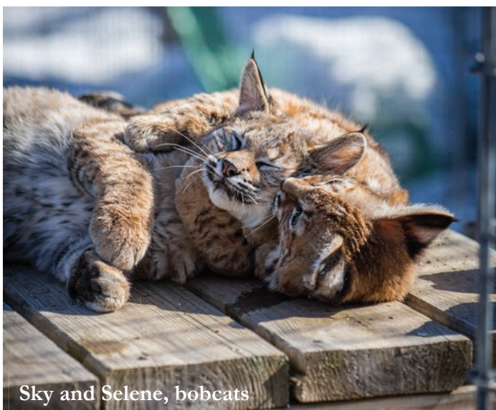
Sky and Selene, bobcats

We're excited to have you alongside us, watching them grow. Second chances like these are only possible because you care.