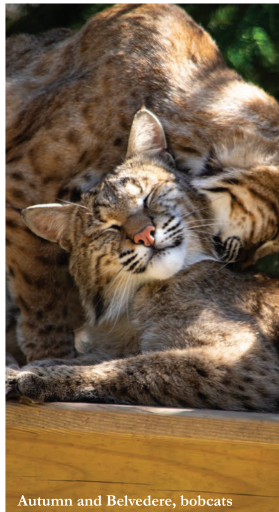
Autumn and Belvedere, bobcats