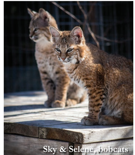
Sky & Selene, bobcats