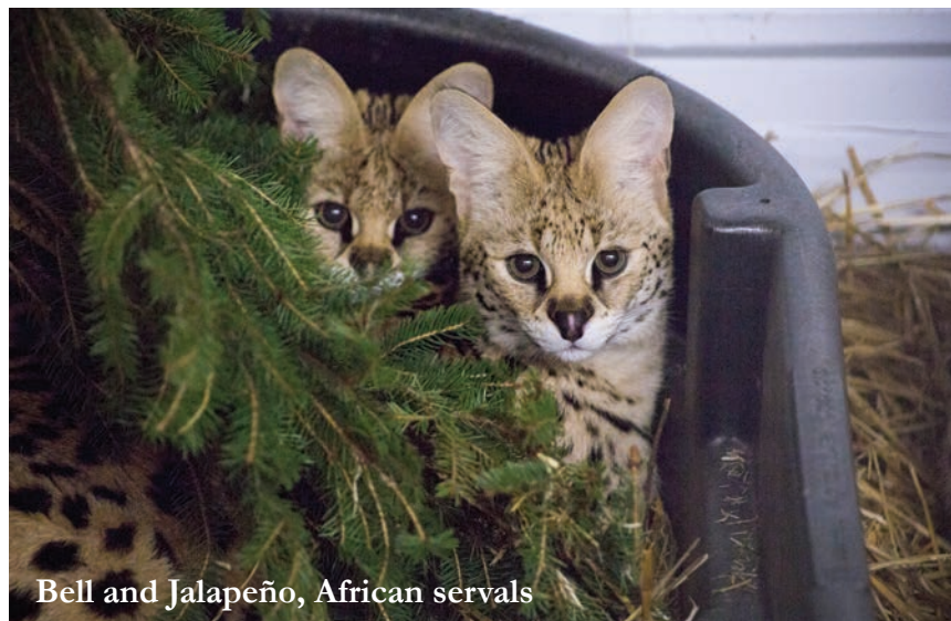
Bell and Jalapeño, African servals