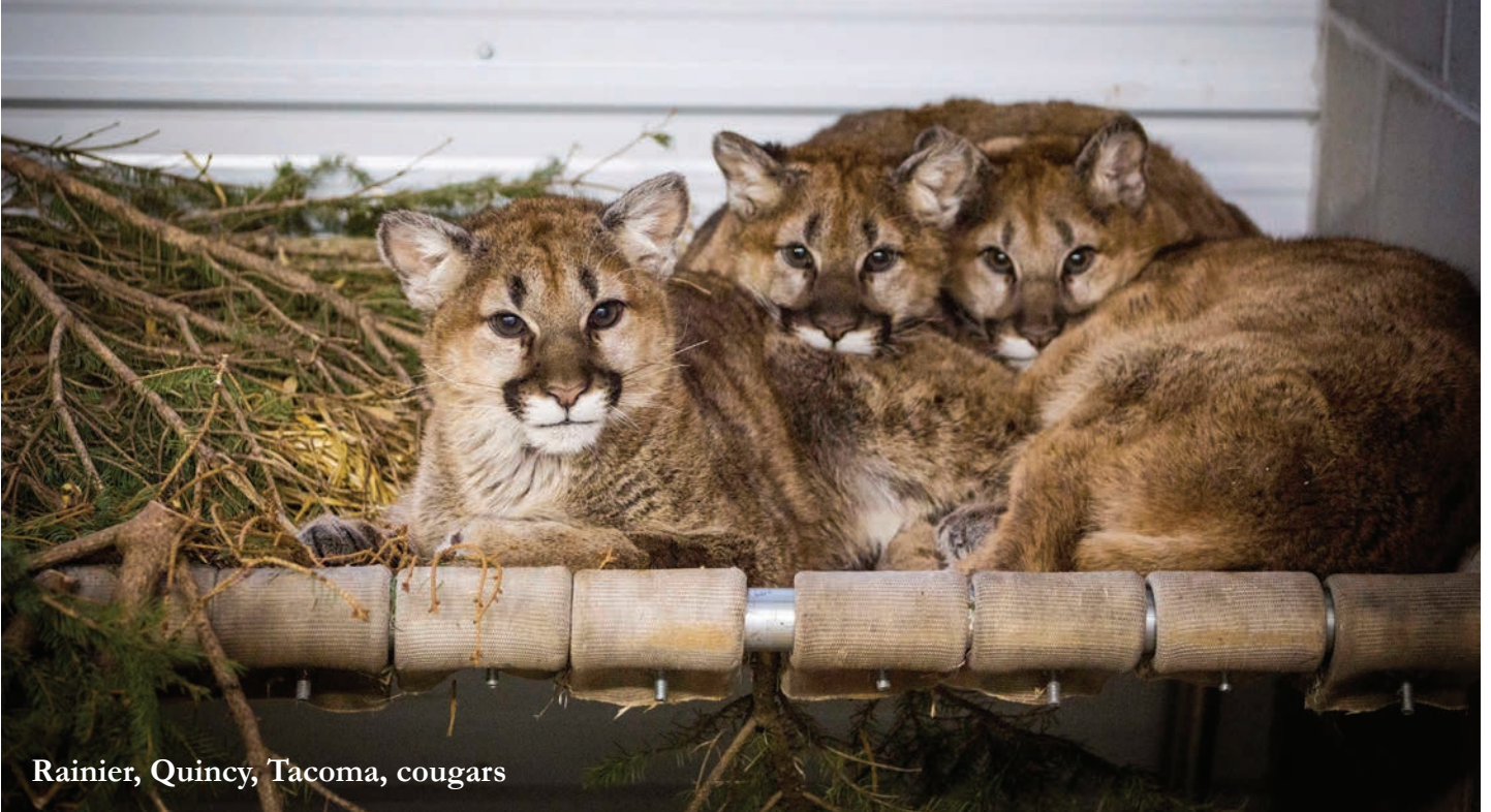
Rainier, Quincy, Tacoma, cougars

I t was that time of year when people were packing into airports, leaving Minnesota for warm, sunny destinations.