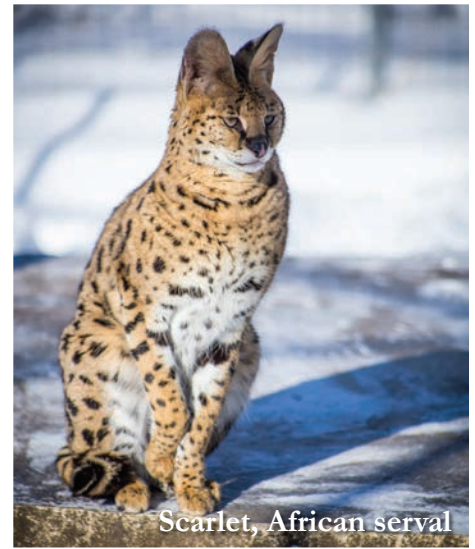
Scarlet, African serval