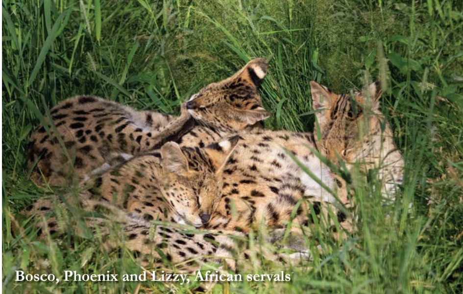
Bosco, Phoenix and Lizzy, African servals