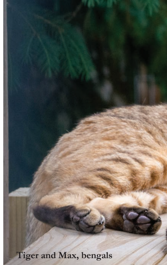
Tiger and Max, bengals