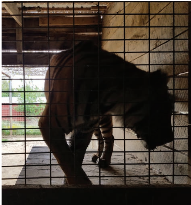
Cats before rescue

This truly is the most important thing you can do to end so much exploitation.