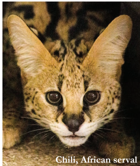
Chili, African serval