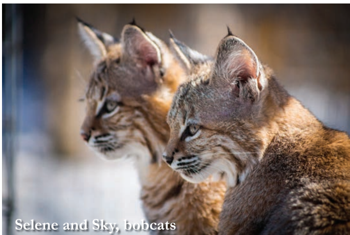
Selene and Sky, bobcats