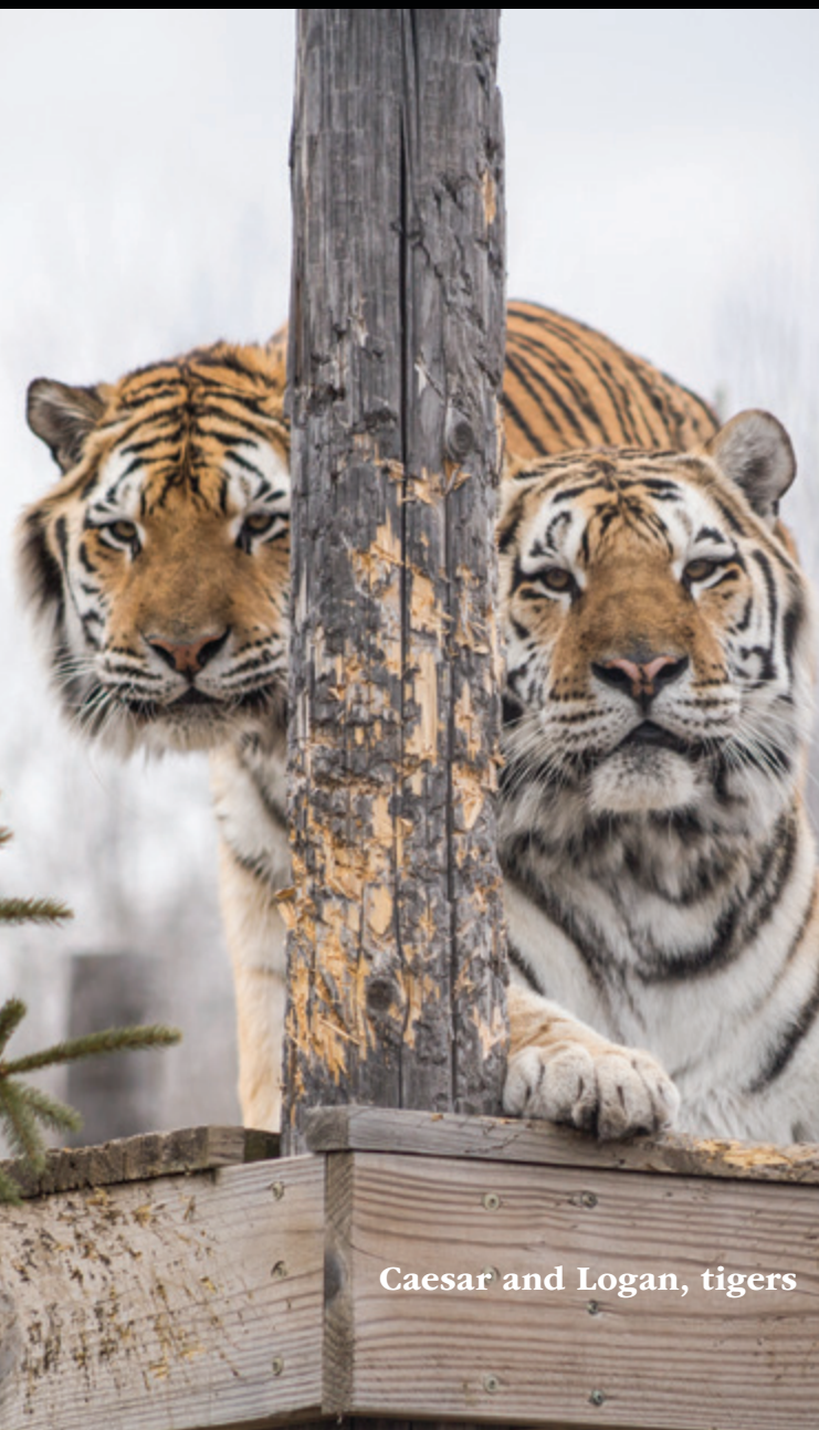
Caesar and Logan, tigers

Remember, when you GIVE TO THE MAX , you help save wild cats in need. Thank you for helping change their world for the better.