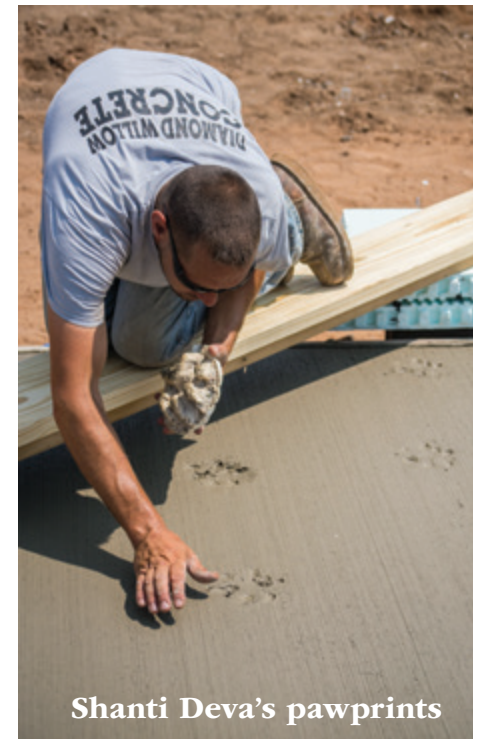
Shanti Deva's pawprints