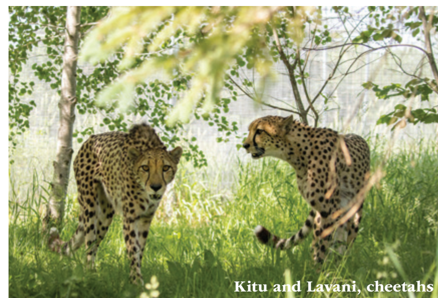
Kitu and Lavani, cheetahs