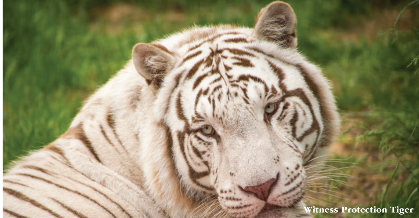
Witness Protection Tiger

No matter the outcome of a case, our sanctuary bears the costs of providing habitat space, food, and veterinary care for these animals.