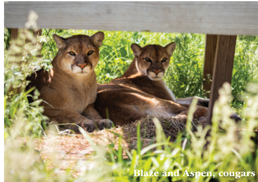
Blaze and Aspen, cougars