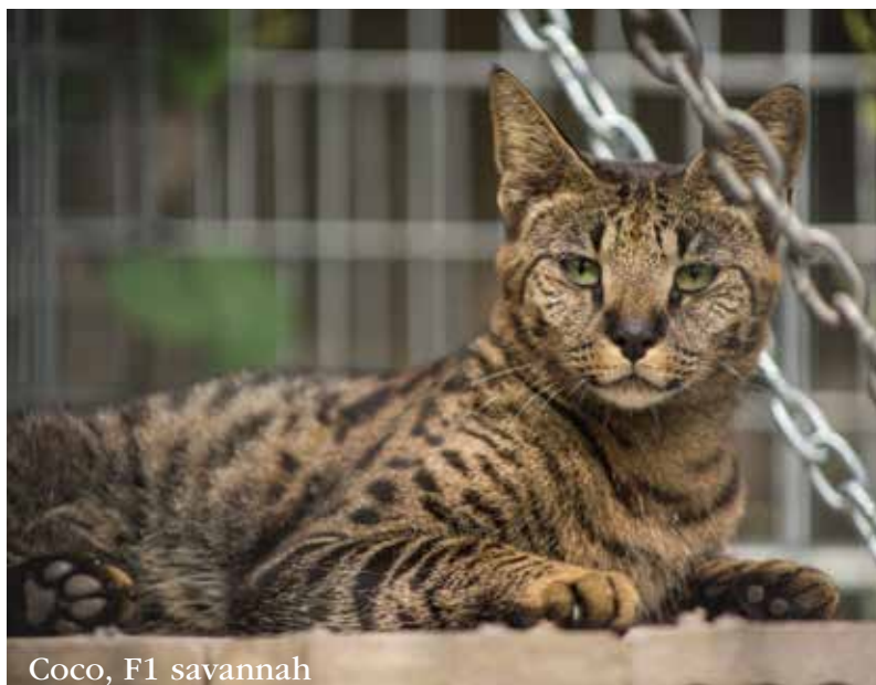
Coco, F1 savannah