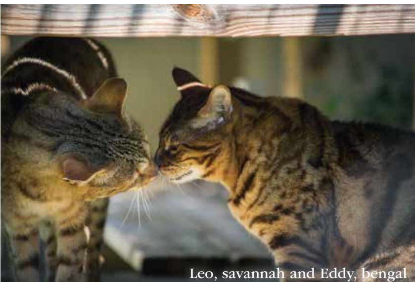
Leo, savannah and Eddy, bengal