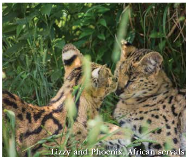
Lizzy and Phoenix, African servals