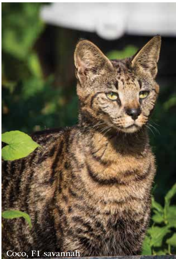
Coco, F1 savannah