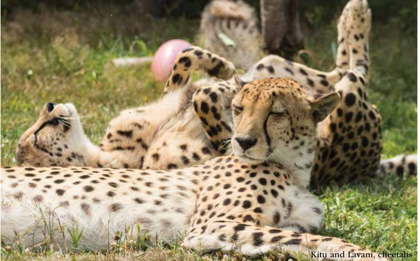
Kitu and Lavani, cheetahs