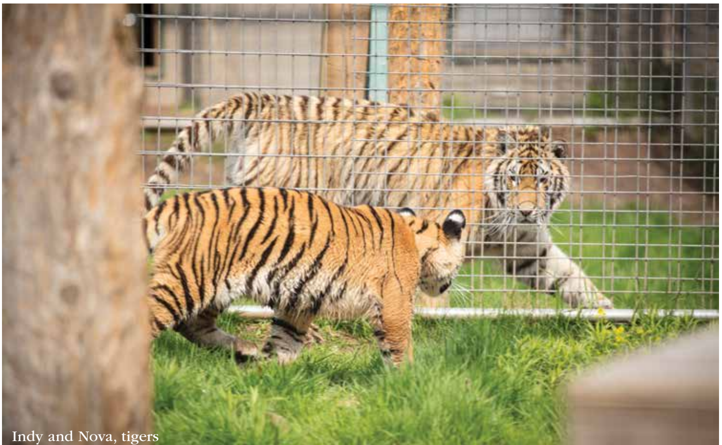
Indy and Nova, tigers