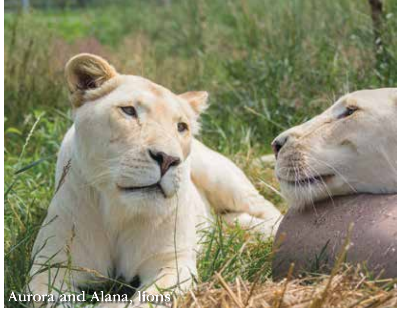
Aurora and Alana, lions