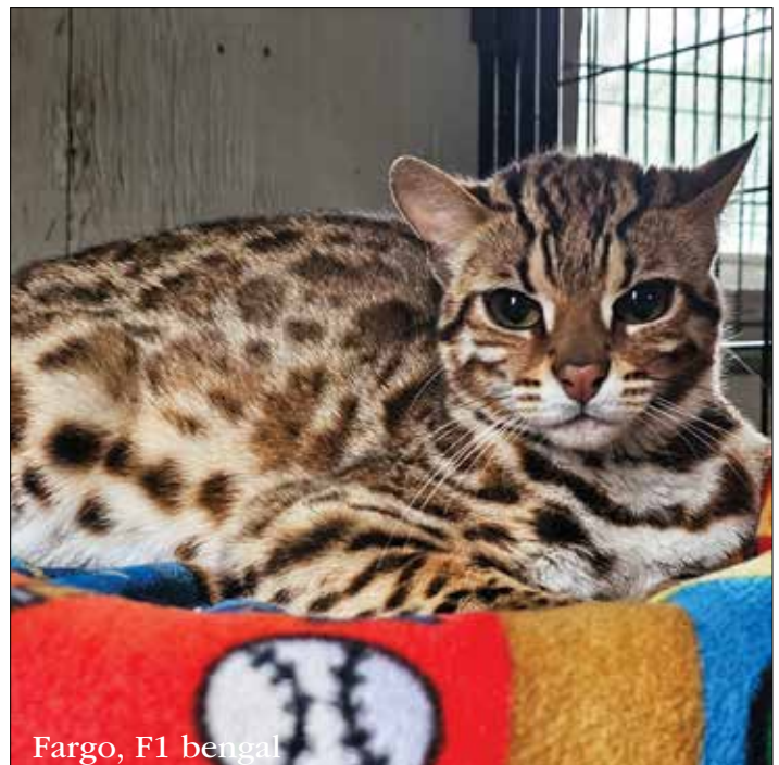
Fargo, F1 bengal

Once she recuperated, she had playdates with the office cats and Kiara the dog. Thankfully, all went well and even Mr. Oreoh decided little Emorhy would make a good addition to the office cat staff – and she certainly has!