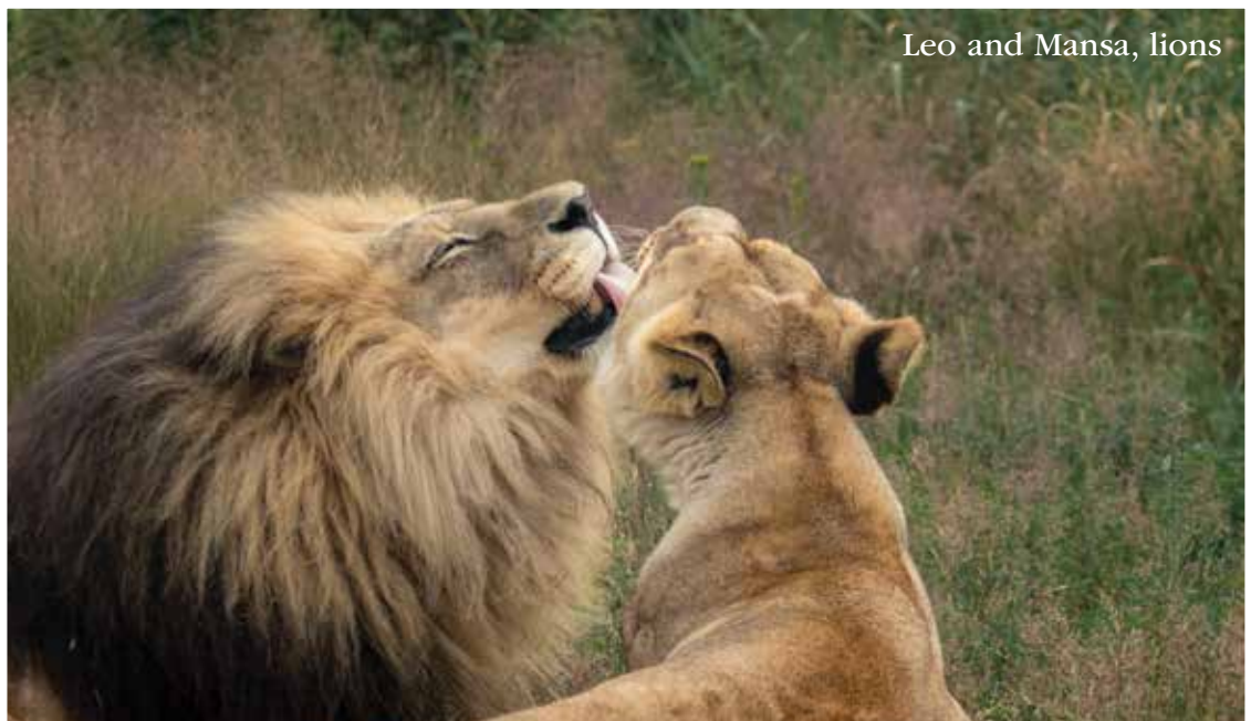
Leo and Mansa, lions