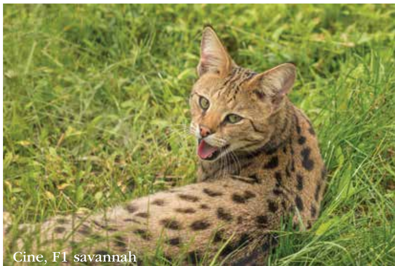
Cine, F1 savannah