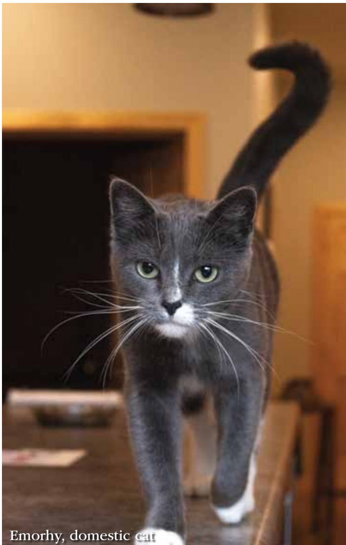
Emorhy, domestic cat