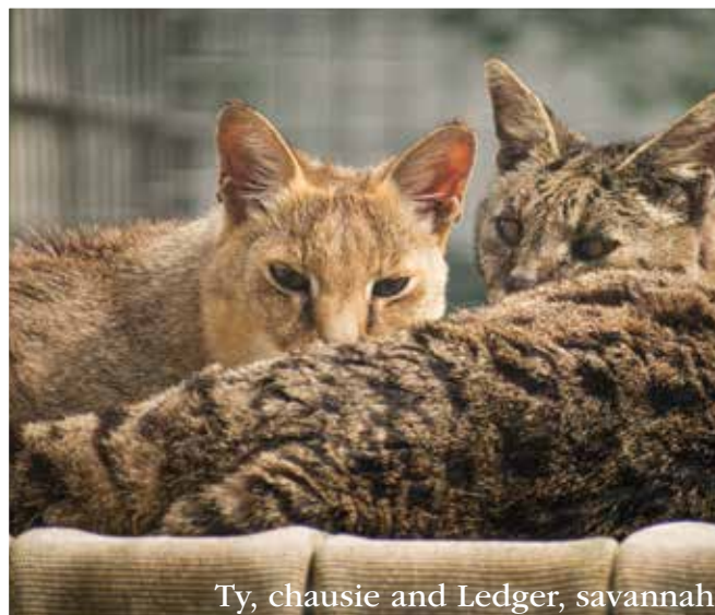
Ty, chausie and Ledger, savannah