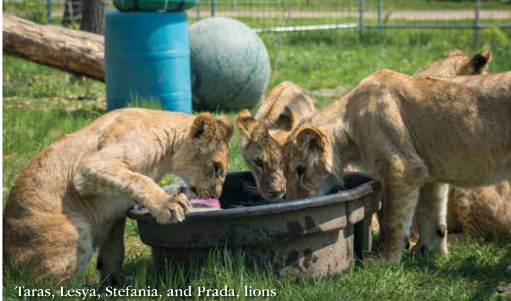
Taras, Lesya, Stefania, and Prada, lions