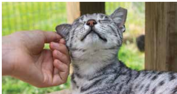
Safiya, Egyptian Mau