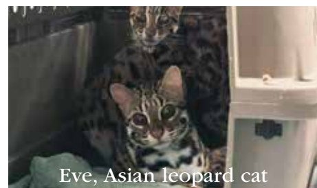
Eve, Asian leopard cat

Eve, we are glad you had a chance to know love and compassion.