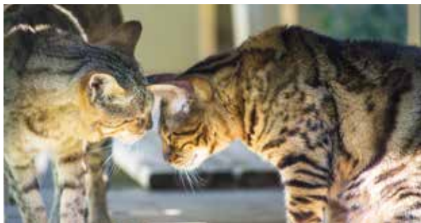
Leo, savannah and Eddy, bengal