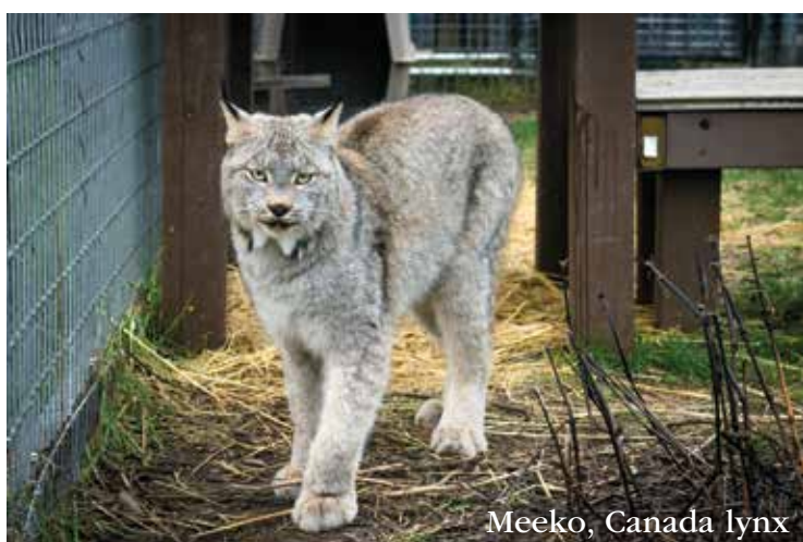
Meeko, Canada lynx