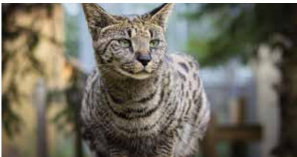
Coco, savannah cat

The Wildcat Sanctuary is one of only a few sanctuaries to specialize in rescuing the smaller wildcats—including hybrids. We're currently home to 50+ hybrids and small cat species and the requests just keep coming in.