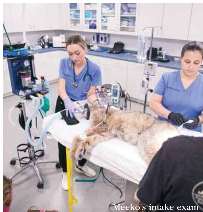
Meeko's intake exam