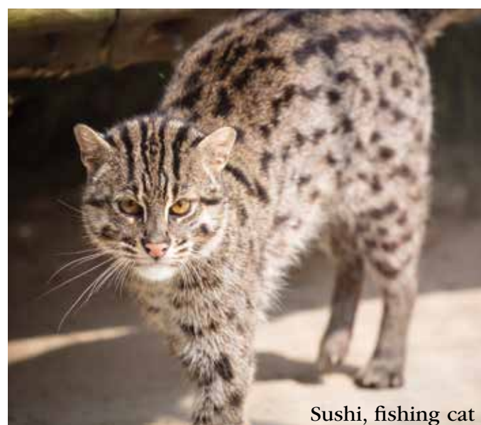
Sushi, fishing cat