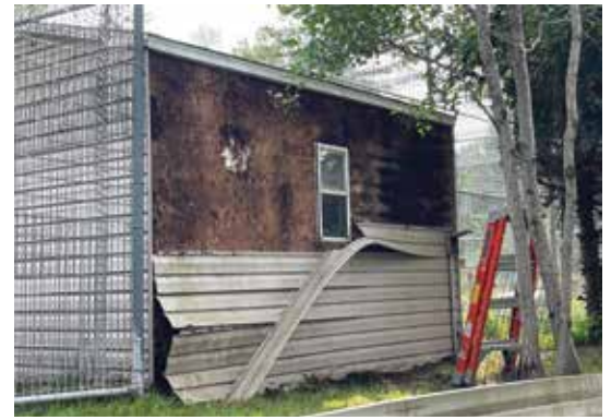
Bungalow in need of repairs