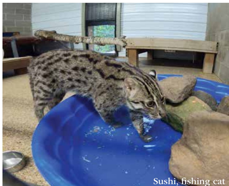
Sushi, fishing cat