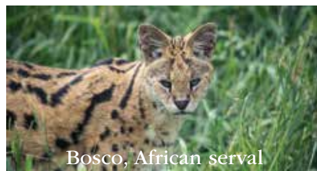
Bosco, African serval

Ty, may there be more cats you can comfort on the other side.