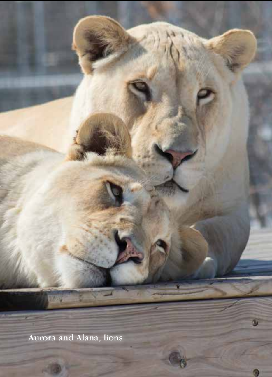
Aurora and Alana, lions