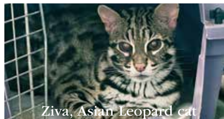
Ziva, Asian Leopard cat

Bosco, we were blessed with so many years to love and care for you.