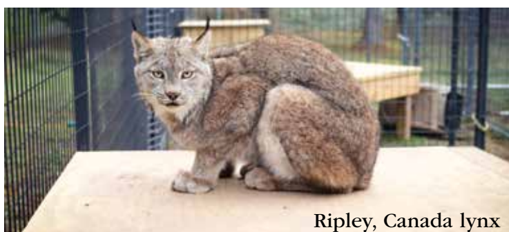
Ripley, Canada lynx